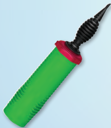
Hand Air Inflator #1992