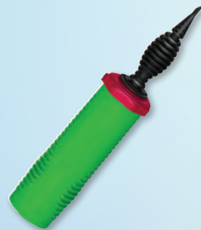
Hand Air Inflator #1992