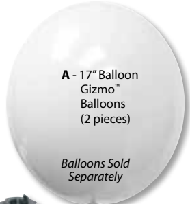
A - 17" Balloon Gizmo Balloons (2 pieces)