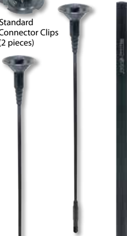
C - Extension Rod