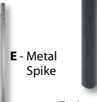
E - Metal Spike